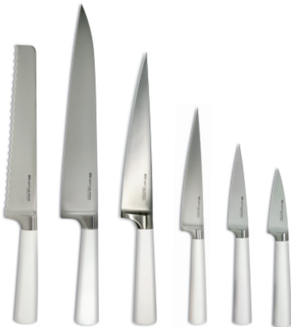
BREAD KNIFE (19cm / 7½" Blade) IF4006