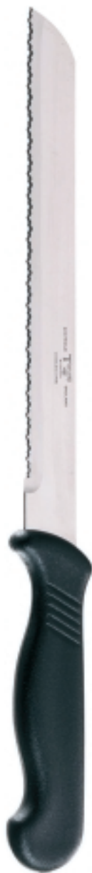
SUPER EDGE BREAD KNIFE (19cm / 7½" Blade) I209