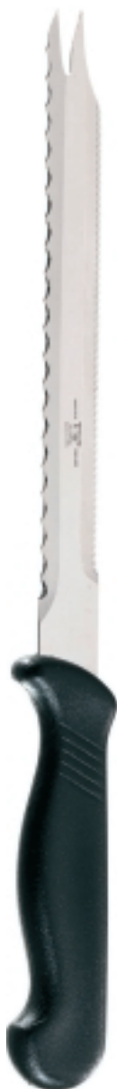
TWIN-EDGE BREAD / ROAST KNIFE (19cm / 7½" Blade) I208