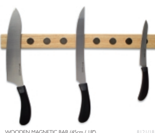
WOODEN MAGNETIC BAR (45cm / 18") $8121/18 For 9 knives. Rubberwood with nickel plated Neodymium magnets - the strongest in the world.