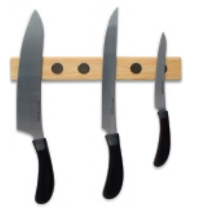
WOODEN MAGNETIC BAR (30cm / 12") 8121/12 For 6 knives. Rubberwood with nickel plated Neodymium magnets - the strongest in the world.