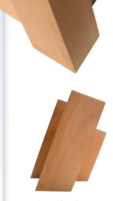
rack viewed from side

Our range of racks and blocks organise your kitchen tools and also keep them safe. Of course, they also help to show off your gadget collection to best advantage.